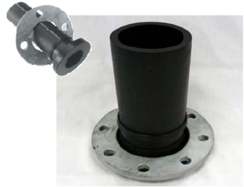
Plate Flanges or Backing Rings

25mm (3/4") stub flange with 250mm long extension 32mm (1") stub flange with 250mm long extension 50mm (1 1/2") stub flange with 250mm long extension 63mm (2") stub flange with 250mm long extension 75mm (2 1/2") stub flange with 250mm long extension 90mm (3") stub flange with 250mm long extension 110mm (4") stub flange with 250mm long extension 160mm (6") stub flange with 250mm long extension 200mm (8") stub flange with 250mm long extension 225mm (8") stub flange with 250mm long extension 280mm (10") stub flange with 300mm long extension 315mm (12") stub flange with 300mm long extension